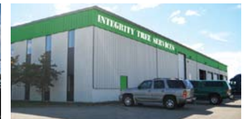
West side of building

The above pictures have been rendered to show the future proposed look of the building exterior.