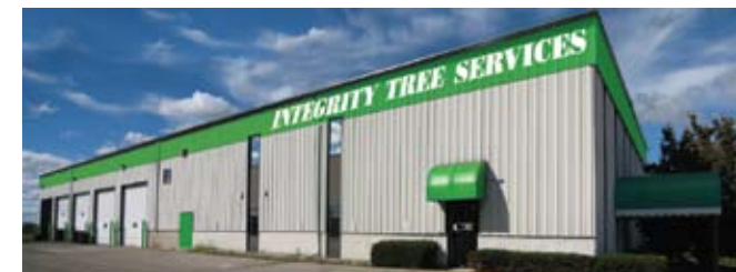
East side of building