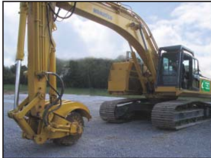
Lang Stump Grinder

The Land Clearing Division just purchased a Lang Stump Grinder to improve the quality of work on all of our large clearing projects. The Land Clearing Division is now the largest clearing crew in West Michigan.