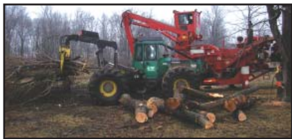
Morbark Whole Tree Chipper & Timberjack Skidder