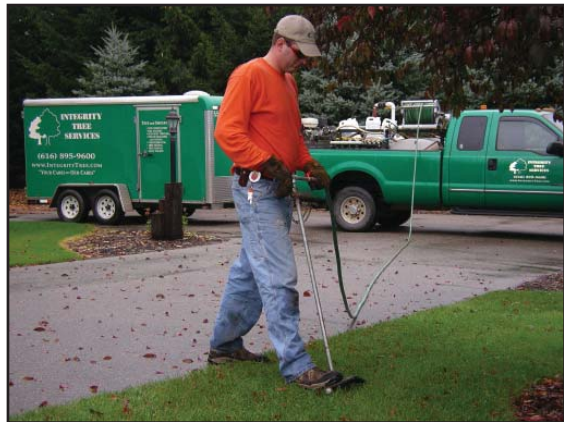
Tim Guikema, TSC expert, performing a Deep Root Injection.

Fall and early Spring are key times to protect trees for the upcoming growing season. We are now injecting many trees for Anthracnose (Sycamore and Oaks), Emerald Ash Borer, Apple Scab and several species of mites.